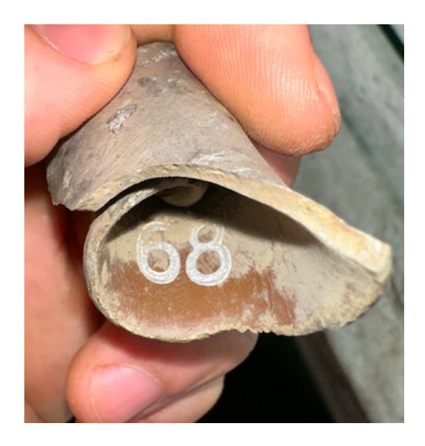
Figure 7: Shrapnel piece from Tumolbil, fuselage FZ 68 rocket, Jamieson 29 April 2023