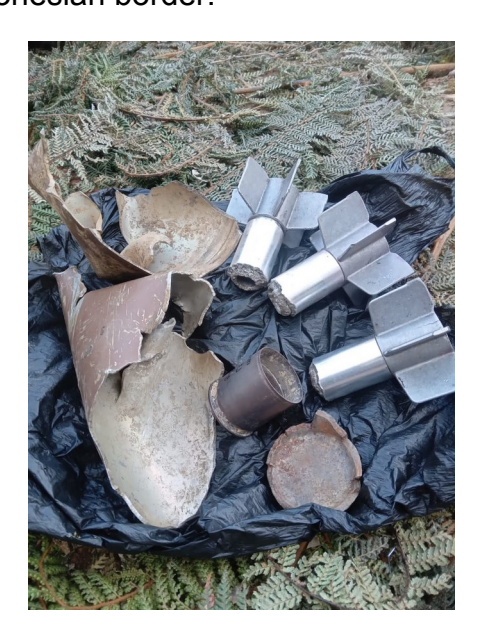
Figure 2 : Rocket fuselage and diaphragm, mortar tails and spent HE grenade shell casing collected from attack site in villages near Kiwirok, October 2021

1. The Ngalum Kupel people, a distinct linguistic ethnic group, are the customary owners of the highland mountain valleys, on tributaries of the Sepik River, adjacent to Kiwirok in the Pengunang Bintang (Star Mountains) region of Papua, Indonesia (West Papua). The Ngalum Kupel people have a subsistence economy based on rotational slash and burn food gardens, animal production of pigs and chickens, combined with hunting and gathering of wild foods and medicines in montane, forest slopes and riverine estates. The Ngalum Kupel people share close customary and linguistic affiliation to Min peoples living around Tumolbil in Papua New Guinea ( PNG ). The villages of the Ngalum Kupel are located North and across the valley from the Indonesian administrative centre and military base of Kiwirok in the Pengunang Bintang region of Papua (West Papua). These villages are in proximity to the PNG/Indonesian border.