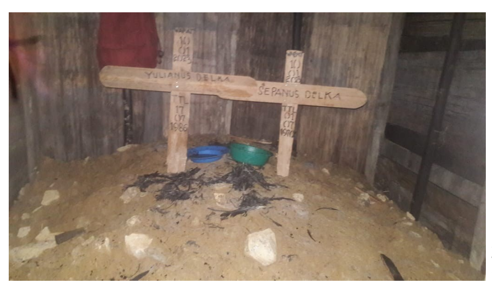
Figure 14: Graves attributed to individuals who died since 10 October 2021

of Indonesia military attacks or as a result of being driven from their homes. Of