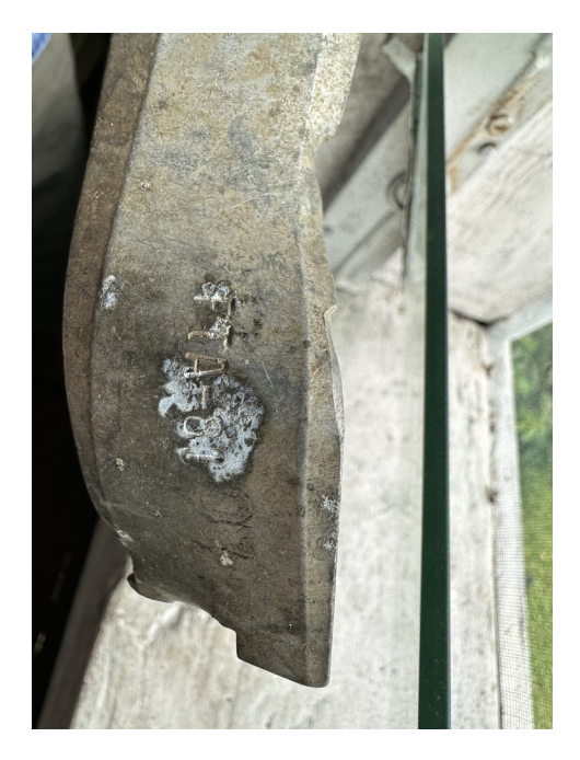
Figure 8: Sample of rocket winglet, from shrapnel in Tumolbil, Jamieson 29 April 2023