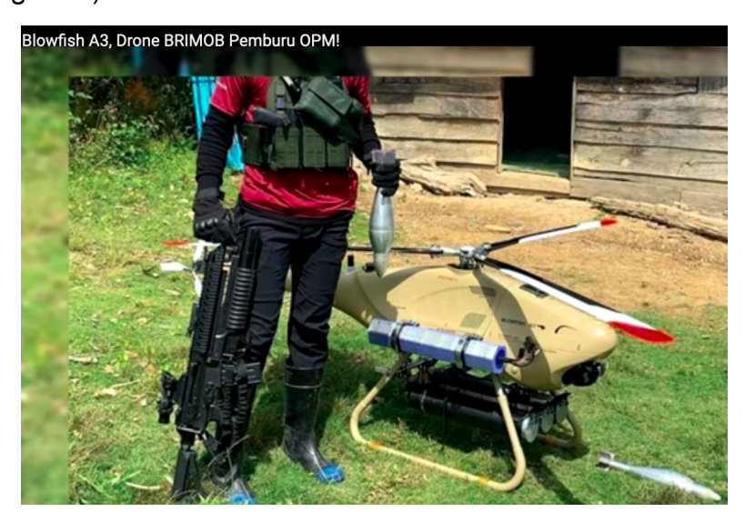
Figure 13 : Image from video relating Brimob usage of Blowfish UAV in Ilaga, Papua https://www.youtube.com/watch?v=2MfGI-HI6sE post dated 18/08/2021

55. A YouTube video report published 18 August 2021 by Indonesian Military News Observer suggests that the Ziyan Blowfish A3 UAV was operated by the Indonesian Paramilitary Police (Brimob) in Ilaga, Papua targeting the OPM (local guerrillas fighters).