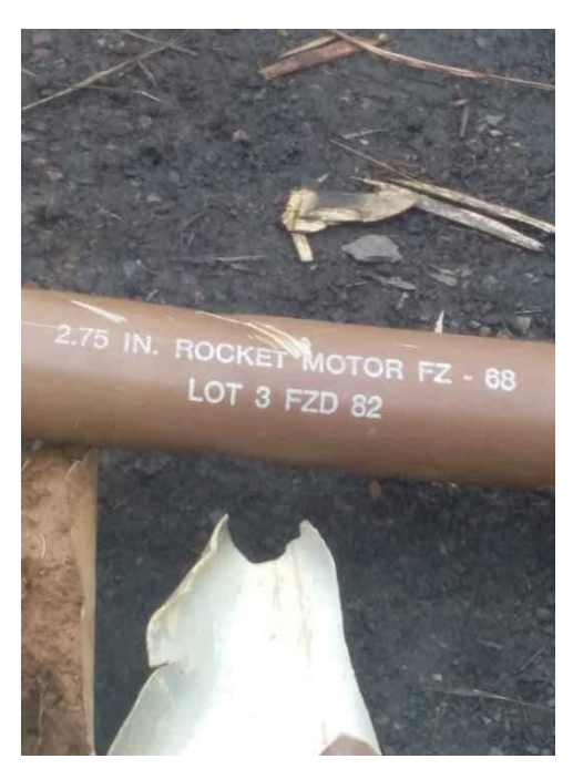
Figure 11 : Same FZ68 rocket and shrapnel from helicopter attack on 3 January 2020, Ugimbe Village Intan Jaya, Papua

Eurocopter AS565 Panther is also used by Indonesia military and can be fitted with Thales rocket systems.