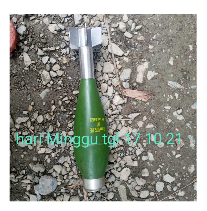
Figure 12: Modified Krusik Mortar collected from Kiwirok attack site dated 17 October 2021

54. Two witnesses were able to draw an unidentified helicopter shaped drone (UAV) with a tail rotor which carried green modified Krusik mortars hanging from the fuselage. These witness drawings of the UAV's configuration together with online investigations of drones used by Indonesian military forces, suggests that the Chinese made Ziyan UAV Blowfish/Fugu<sup>12</sup> is likely to have been the drone/UAV used in the Kiwirok attacks.