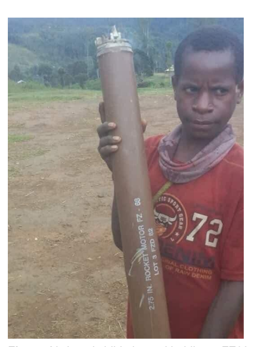
Figure 10 : Local child pictured holding a FZ68 rocket from helicopter attack on 3 January 2020, Ugimbe Village Intan Jaya Papua