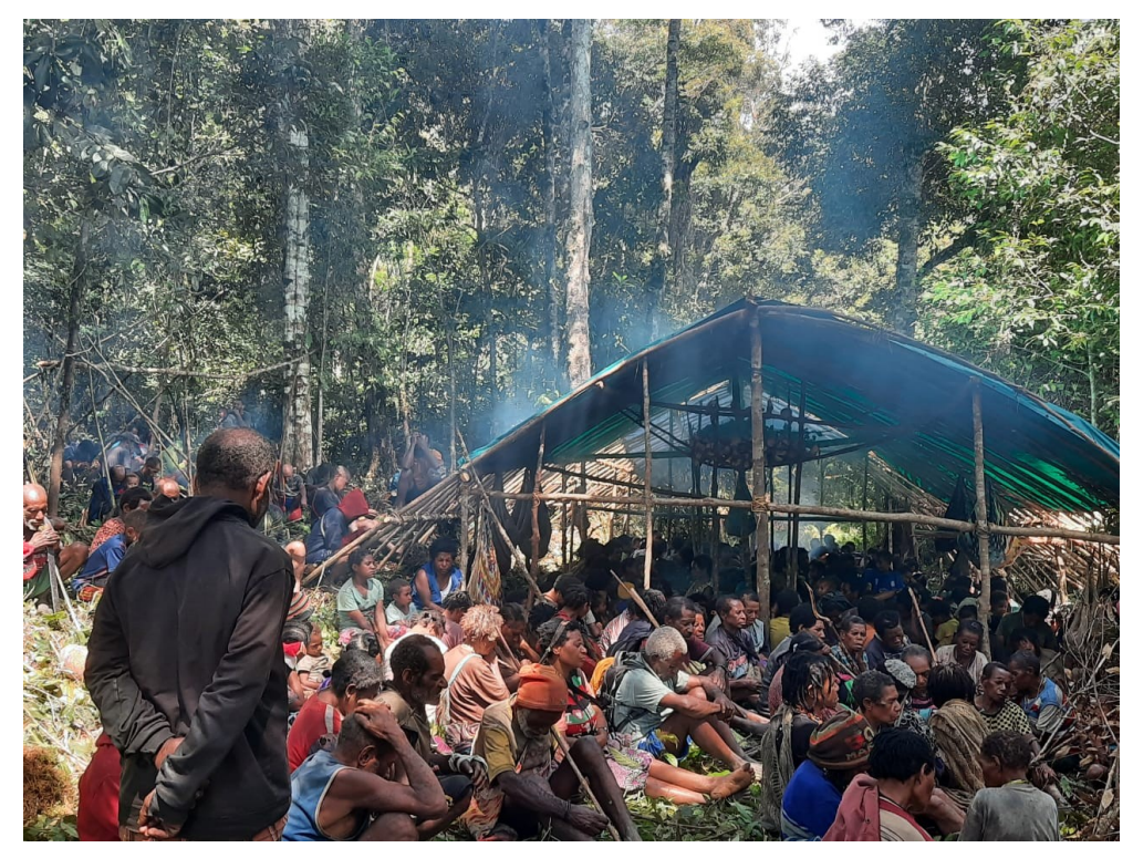
Figure 9: Ngalum people in a temporary camp after fleeing from attacks October 2021

46. The witnesses report that over a two-day period after the initial attack, people were able to make shelters from bush materials on the mountain. While shelters were