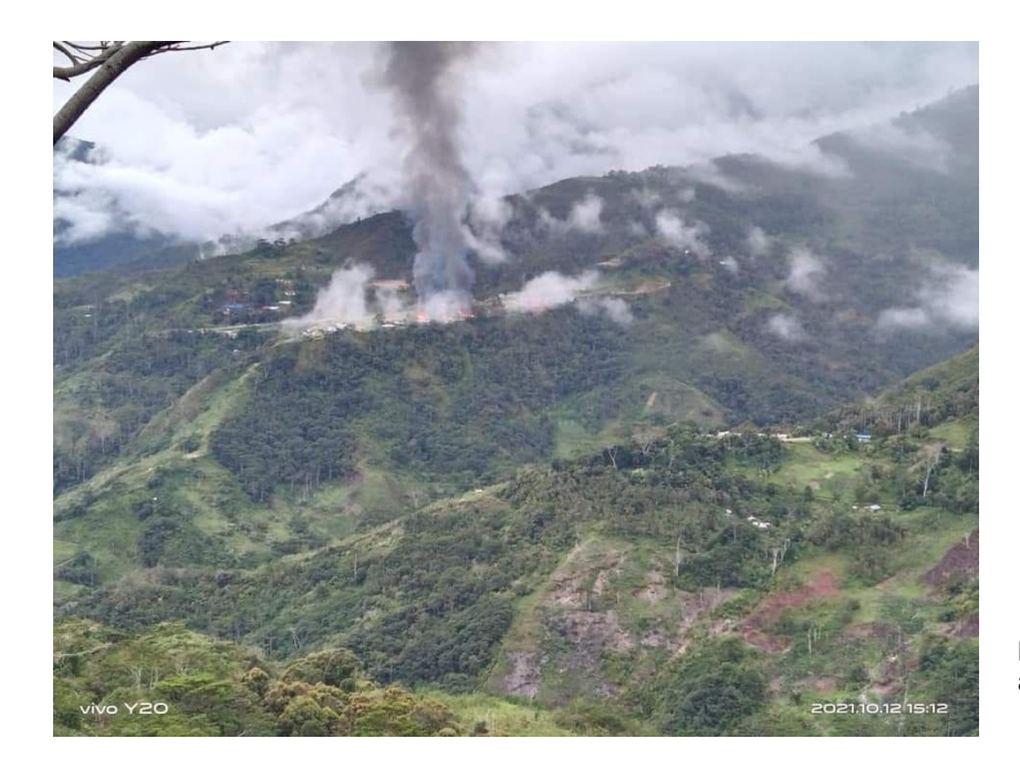
Figure 3: Photograph of military attack, 12 October 2021