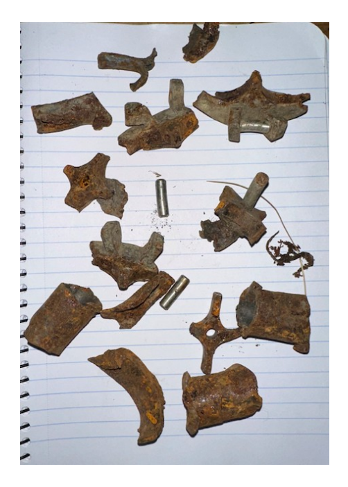
Figure 5 : Shrapnel samples from Tumolbil including rocket winglet mountings, Jamieson 29 April 2023.