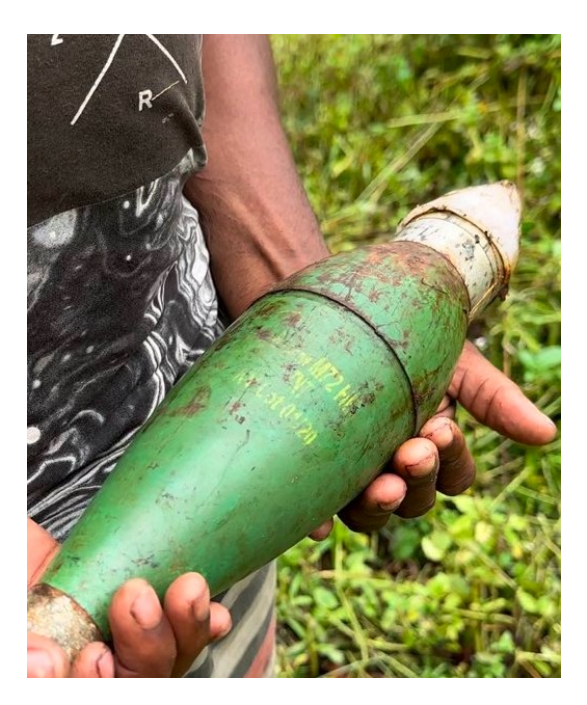
Figure 6: Modified Krusik mortar from Tumolbil, Langker 28 April 2023