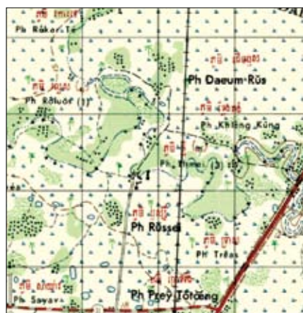
Air operations were subject to rules of engagement that prohibited the use of B-52s against targets closer than one kilometre to friendly forces, villages, hamlets, houses, monuments, temples, pagodas, or holy places. —HENRY KISSINGER, ENDING THE VIETNAM WAR

Five minutes after his conversation with Nixon ended, Kissinger called General Alexander Haig to relay the new orders from the president: “He wants a massive bombing campaign in Cambodia. He doesn't want to hear anything. It's an order, it's to be done. Anything that flies, on anything that moves. You got that?” The response from Haig, barely audible on tape, sounds like laughter.