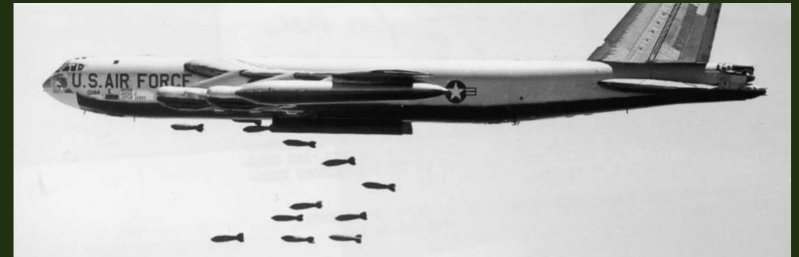
US Air Force bombers like this B-52, shown releasing its payload over Vietnam, helped make Cambodia one of the most heavily bombed countries in history—perhaps the most heavily bombed.

The still-incomplete database (it has several “dark” periods) reveals that from October 4, 1965, to August 15, 1973, the United States dropped far