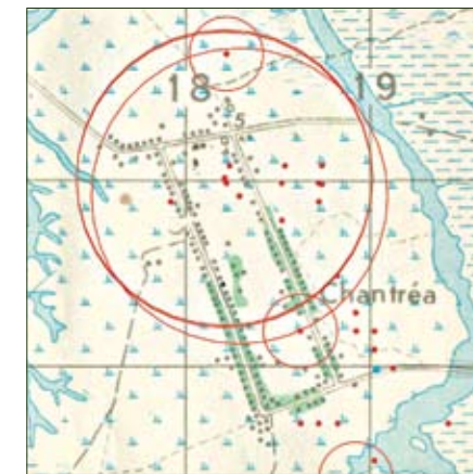
The town of Chantrea in southern Cambodia was destroyed by 2,245 tons of US ordnance.

The Cambodian bombing campaign had two unintended side effects that ultimately combined to produce the very domino effect that the Vietnam War was supposed to prevent. First, the bombing forced the Vietnamese Communists deeper and deeper into Cambodia, bringing them into greater contact with Khmer Rouge insurgents. Second, the bombs drove ordinary Cambodians into the arms of the Khmer Rouge, a group that seemed initially to have slim prospects of revolutionary success. Pol Pot himself described the Khmer Rouge during that