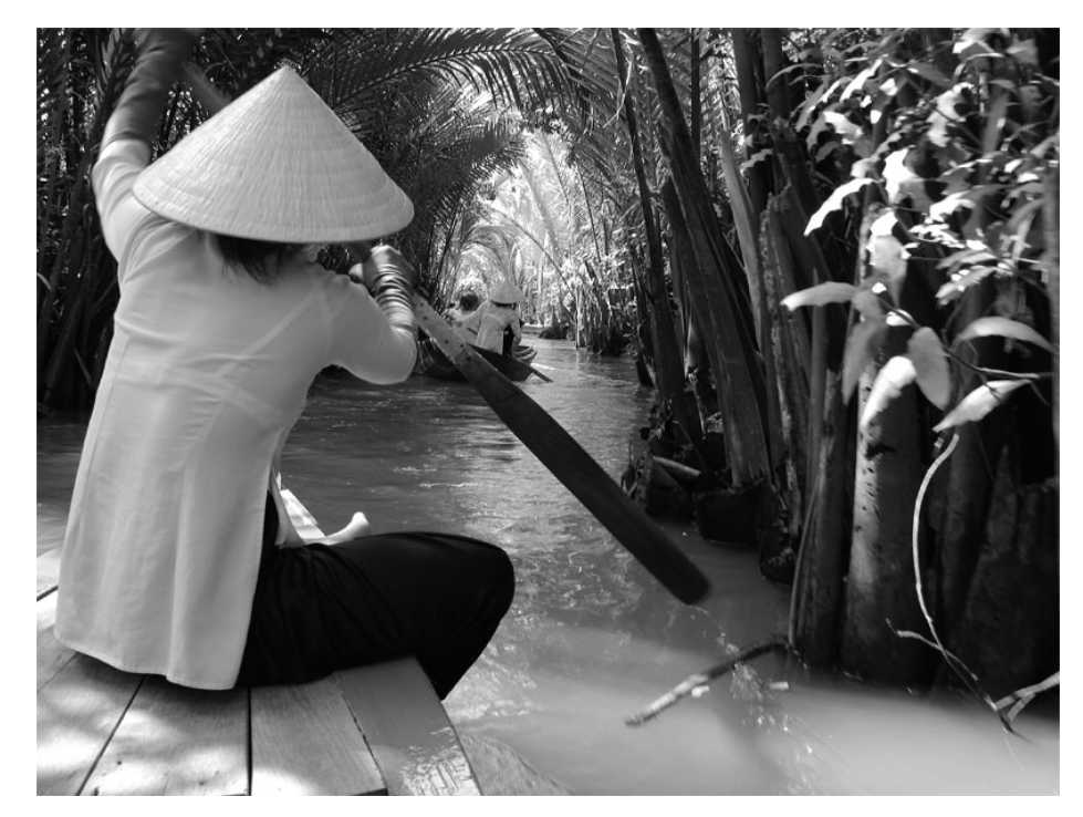
Mekong River, 2007